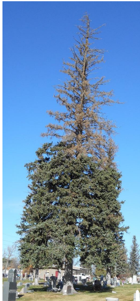
Spruce tend to die from the top down when attacked by ips beetle

However, care must be taken to prevent the spread of beetles from the tree that is cut down to living trees. Infested spruce wood with ips beetle larvae has the potential to produce adult beetles that can infest new trees in the spring. Therefore, infested wood which can include larger branches and trunk sections should be chipped, debarked, burned over the winter, hauled to a remote location that is at least one